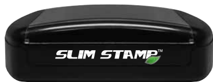
SLIM STAMP 1444