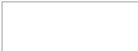
SLIM STAMP 2773