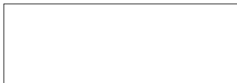
SLIM STAMP 2264